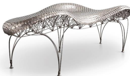
Johnny Swing (b. 1961) Storm King Bench welded nickels and stainless steel, 2017 $50,000 - 70,000