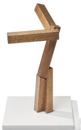
Joel Shapiro Untitled bronze on painted metal base, 2016-2017 $50,000 - 70,000