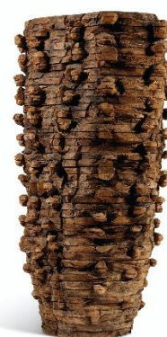
Ursula von Rydingsvard Ona cedar, in two parts, 2005-2006 $90,000 - 120,000