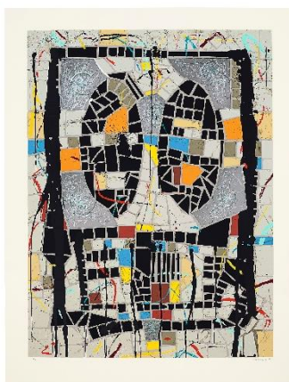
Rashid Johnson (b. 1977) Broken Men 27 color silkscreen with Mylar collage, 2019 $25,000 - 35,000