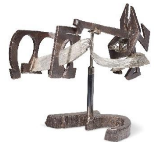
Mark di Suvero, The Implication steel, in two parts, 2012 $50,000-70,000

NEW YORK – In its December 3 Post-War and Contemporary Art Day Sale, Christie's will present a grouping of seven works sold to benefit Storm King Art Center. Each of the contemporary artworks has been generously donated by a Storm King artist in recognition of the Art Center's 60 th anniversary. One hundred percent of the hammer price will support Storm King's work to steward its 500-acre Hudson Valley landscape, support artists and some of their most ambitious works, and offer a unique place where art, nature, and people come together. The grouping encompasses examples by artists including Mark di Suvero, Rashid Johnson, Martin Puryear, Ursula von Rydingsvard, Richard Serra, Joel Shapiro, and Johnny Swing.