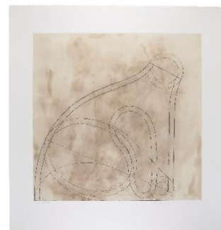
Martin Puryear (b. 1941) Untitled VI (State 1) aquatint, drypoint, and spitbite aquatint etching, 2012 $10,000 - 15,000